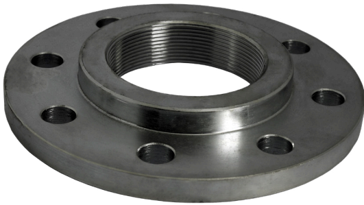
TABLE 16 THREADED FLANGE